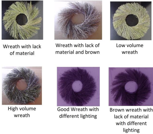
Fig. 1. Example of the dataset created by our own source for the wreaths.

It is important to note that the incorporation of a diverse range of defects and the deliberate introduction of noise in the dataset were undertaken to bolster the model's capability to accurately detect and classify defective flower wreaths in a realistic setting. These considerations aimed to ensure the model's generalizability and effectiveness when applied to real-world scenarios beyond the controlled environment of the training dataset.